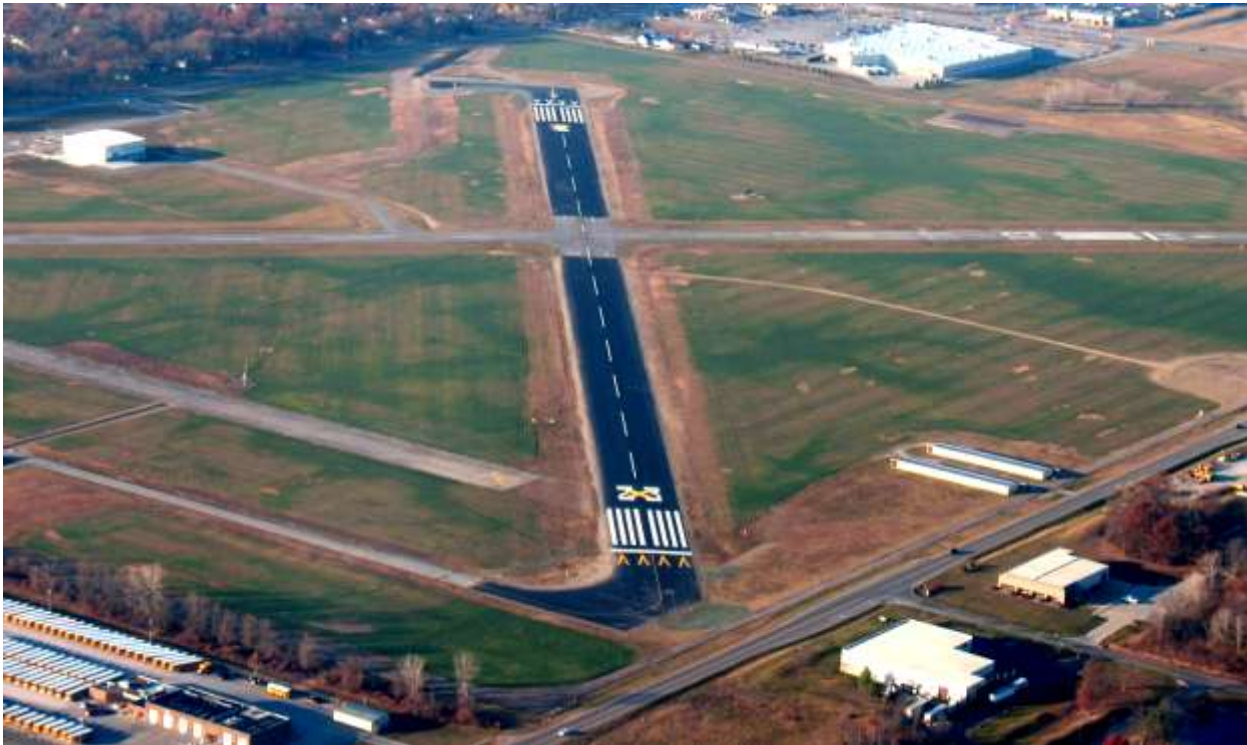
Figure 2-1 Markings for a Temporarily Closed Runway

(b) Temporarily Closed Runways. For runways that have been temporarily closed, place an X at the each end of the runway directly on or as near as practicable to the runway designation numbers. Figure 2-1 illustrates.