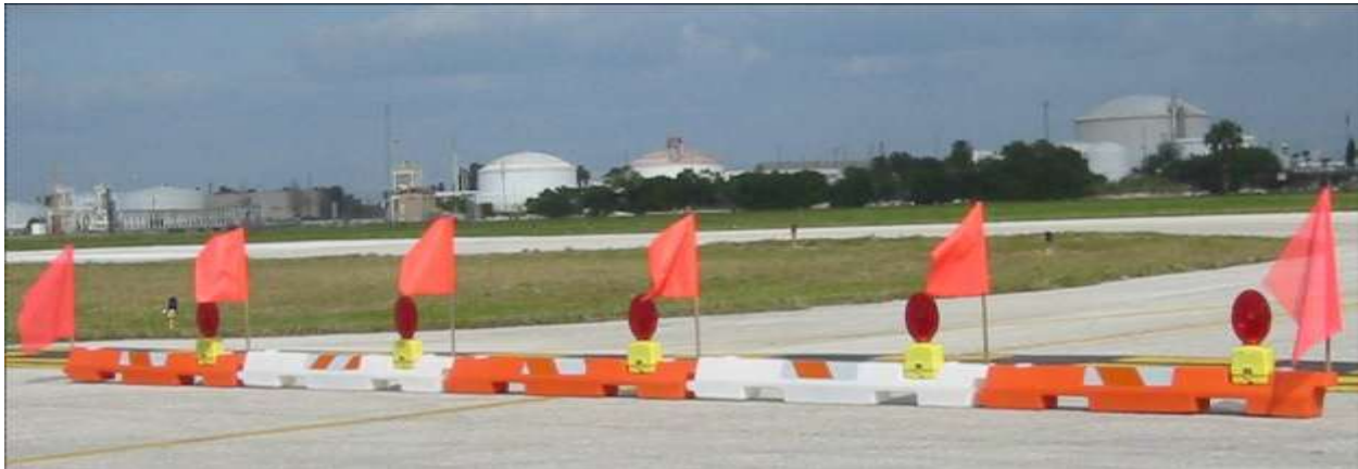
Figure 2-5 Interlocking Barricades

white stripes; and/or signs to separate all construction/maintenance areas from the movement area. Barricades may be supplemented with alternating orange and white flags at least 20 by 20 in (50 by 50 cm) square and securely fastened to eliminate FOD. All barricades adjacent to any open runway or taxiway / taxilane safety area, or apron must be as low as possible to the ground, and no more than 18 in high, exclusive of supplementary lights and flags. Barricades must be of low mass; easily collapsible upon contact with an aircraft or any of its components; and weighted or sturdily attached to the surface to prevent displacement from prop wash, jet blast, wing vortex, or other surface wind currents. If affixed to the surface, they must be frangible at grade level or as low as possible, but not to exceed 3 in (7.6 cm) above the ground. Figure 2-5 and Figure 2-6 show sample barricades with proper coloring and flags.