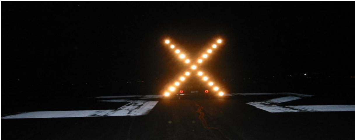
Figure 2-4 Lighted X at Night

(3) Partially Closed Runways and Displaced Thresholds. When a runway is partially closed, a portion of the pavement is unavailable for any aircraft operation, meaning taxiing and landing or