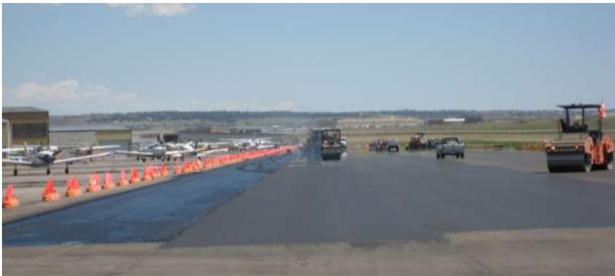
Figure 2-6 Low Profile Barricades

(5) Air Operations Area – Runway/Taxiway Intersections. Use highly reflective barricades with lights to close taxiways leading to closed runways. Evaluate all operating factors when determining how to mark temporary closures that can last from 10 to 15 minutes to a much longer period of time. However, even for closures of relatively short duration, close all taxiway/runway intersections with barricades. The use of traffic cones is appropriate for short duration closures.