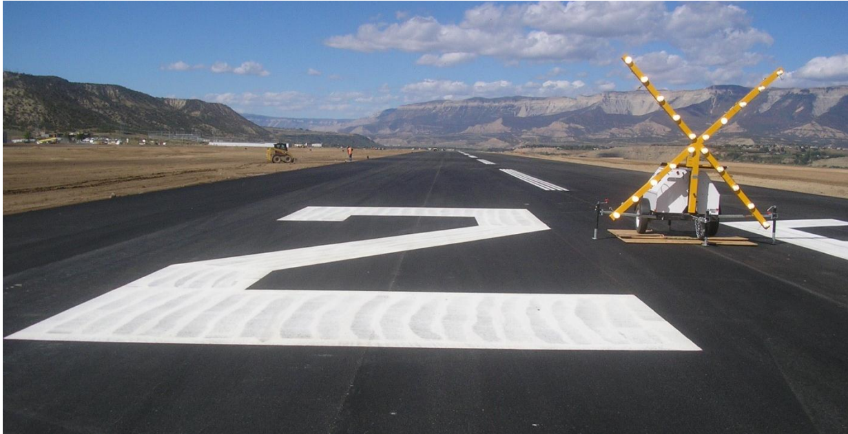
Figure 2-3 Lighted X in Daytime

(2) Temporarily Closed Runways. If available, use a lighted X, both at night and during the day, placed at each end of the runway facing the approach. The use of a lighted X is required if night work requires runway lighting to be on. See AC 150/5345-55, Specification for L-893, Lighted Visual Aid to Indicate Temporary Runway Closure. For runways that have been temporarily closed, but for an extended period, and for those with pilot controlled lighting, disconnect the lighting circuits or secure switches to prevent inadvertent activation. For runways that will be opened periodically, coordinate procedures with the FAA air traffic manager or, at airports without an ATCT, the airport operator. Activate stop bars if available. Figure 2-3 shows a lighted X by day. Figure 2-4 shows a lighted X at night.