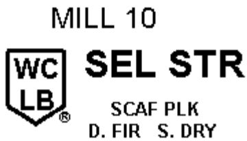
Grade stamp