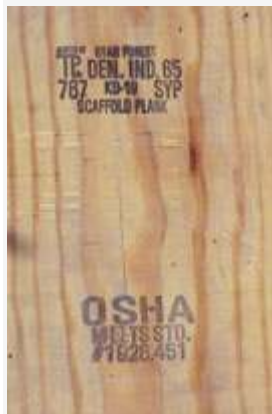
Figure 3. Scaffold plank with grade stamps.

Such organizations and their grading rules must be certified by the Board of Review of the American Lumber Standard Committee, per the U.S. Department of Commerce.