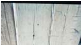
Figure 5. Checks in wood plank.

Planks with splits (cracks that go clear through the wood) more than a few inches in length should not remain in service, as they may no longer maintain the necessary load-bearing capacity.