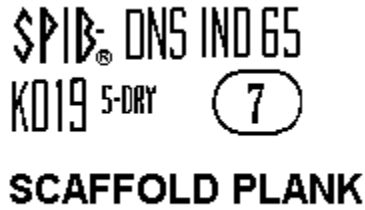
Grade stamp

Solid sawn wood used for scaffold planks should follow the grading rules of a recognized lumber grading association or an independent lumber inspection agency , and be identified by that agency or association's grade stamp (see examples below).