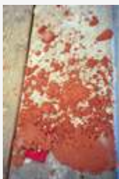
Figure 7. Accumulated layers of paint and plaster on wood plank.

Notches (small checks on the ends of a plank) should also be watched over time, as they can lengthen and deepen until they become splits.