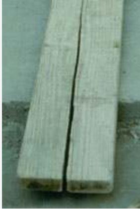
Figure 4. Split in wood plank.

Planks with splits (cracks that go clear through the wood) more than a few inches in length should not remain in service, as they may no longer maintain the necessary load-bearing capacity.